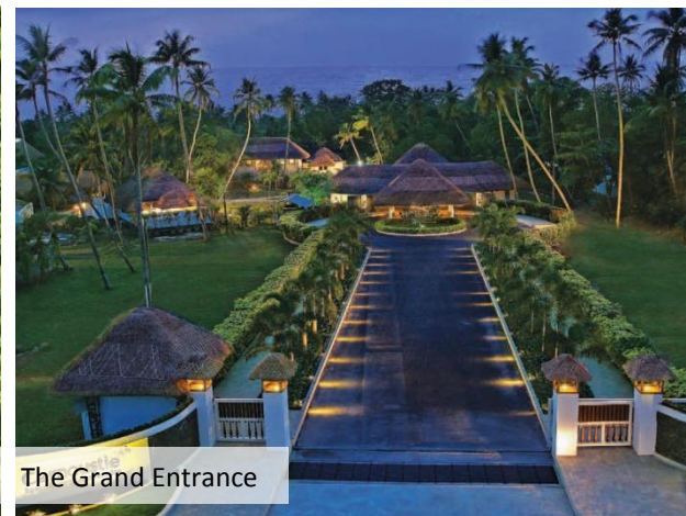
The Grand Entrance