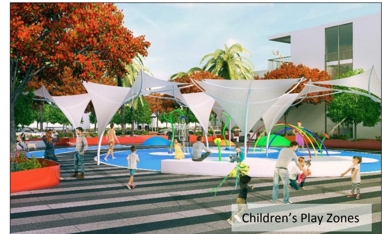
Children's Play Zones